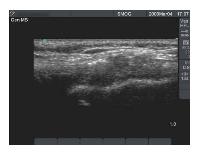
Fig. 8 Ultrasound guided knee MCL injection/graft

The authors are currently expanding PRP injection applications from tendon injuries to other persistent ailments including greater trochanteric bursitis and knee osteoarthritis with favorable results. The authors also have had success in injecting professional soccer athletes with acute MCL knee injuries in an effort to accelerate their return to play (Fig. 8). Further understanding of this promising treatment is required to determine which