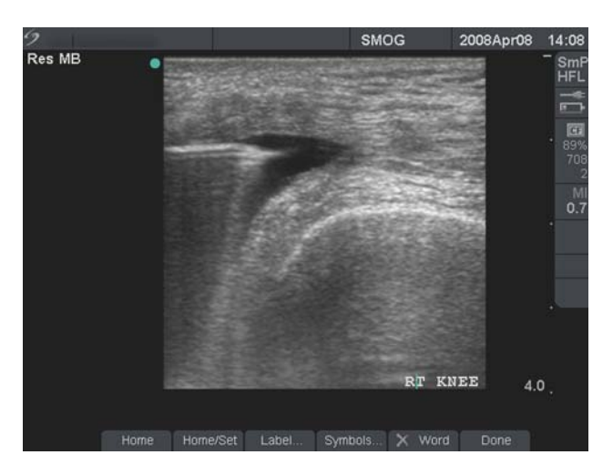
Fig. 7 Ultrasound guided suprapatella bursa injection/graft

Barett et al. enrolled nine patients in a pilot study to evaluate PRP injections with plantar fasciitis. Patients met the criteria if they were willing to avoid conservative treatments including bracing, NSAIDS, and avoidance of a cortisone injection for 90 days prior. All patients demonstrated hypoechoic and thickened plantar fascia on ultrasound. While anesthetizing each patient with a block of the posterior tibial and sural nerve, 3 cc of autologous PRP was injected under ultrasound guidance (Fig. 7).