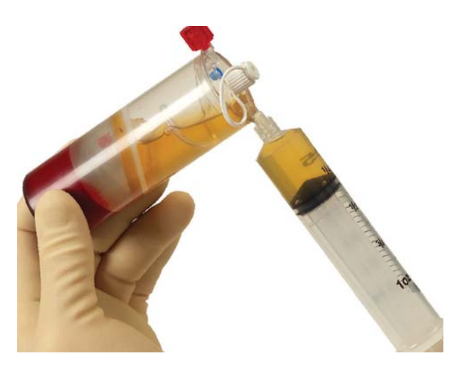
Fig. 4 GPS III system, withdrawing of platelet poor plasma to be discarded

aseptic technique from the anticubital vein. An 18 or 19 g butterfly needle is advised, in efforts of avoiding irritation and trauma to the platelets which are in a resting state. The blood is then placed in an FDA approved device and centrifuged for 15 min at 3,200 rpm (Fig. 3). Afterward, the blood is separated into platelet poor plasma (PPP), RBC, and PRP. Next the PPP is extracted through a special port and discarded from the device (Fig. 4). While the PRP is in a vacuumed space, the device is shaken for 30 s to resuspend the platelets. Afterwards the PRP is withdrawn (Fig. 5). Depending on the initial blood draw, there is approximately 3 or 6 cc of PRP available.