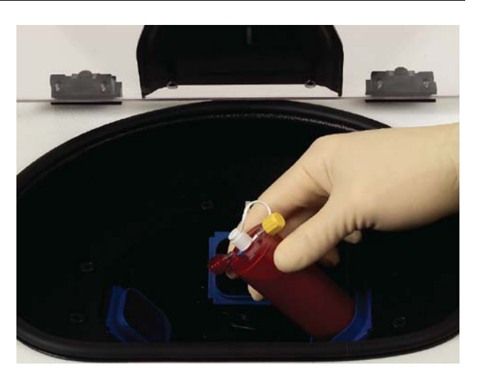
Fig. 3 GPS III system and centrifuge

Various blood separation devices have differing preparation steps essentially accomplishing similar goals. The Biomet Biologics GPS III system is described here for simplicity. About 30–60 ml of venous blood is drawn with