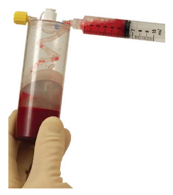
Fig. 5 GPS III withdrawing of platelet rich plasma for injection/graft

and radiographs. It is recommended to use dynamic musculoskeletal ultrasound with a transducer of 6-13 Hz in an effort to more accurately localize the PRP injection. Under sterile conditions, the patient receives a PRP injection with or without approximately 1 cc of 1% lidocaine and 1 cc of 0.25 Marcaine directly into the area of injury. Calcium chloride and thrombin may be added to provide a gel matrix for the PRP to adhere to, potentially maximizing the benefit in the case of a joint space. We recommend using a peppering technique spreading in a clock-like manner to achieve a more expansive zone of delivery. The patient is observed in a supine position for 15-20 min afterwards, and is then discharged home. Patients typically experience minimal to moderate discomfort following the injection which may last for up to 1 week. They are instructed to ice the injected area if needed for pain control in addition to elevation of the limb and modification of activity as tolerated. We recommend acetaminophen as the optimal analgesic, or Vicodin for break through pain, and dissuade the use of NSAID's in the early post-injection period (Fig. 6).